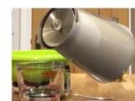
8. Add 300ml warm water (200 ml cold: 100 ml boiling water)