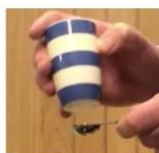
4. Add 1 tsp salt