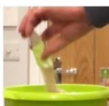
7. Add 3 tsp Olive Oil