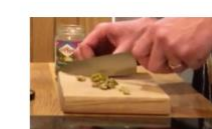
9. Chop Olives into quarters