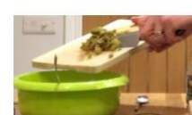
10. Add Olives