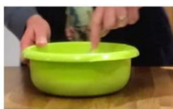
6. Stir together