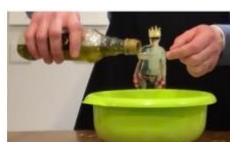
7. Add 3 tsp Olive Oil