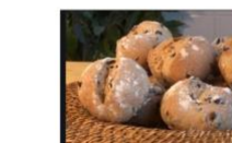
18. Enjoy your scrummy buns!!