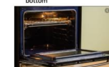
17. Prove for 1 hour and place in oven (200C) to bake for 10-11 minutes