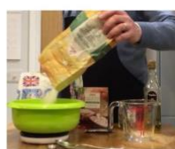
2. Pour 500g Strong Bread Flour