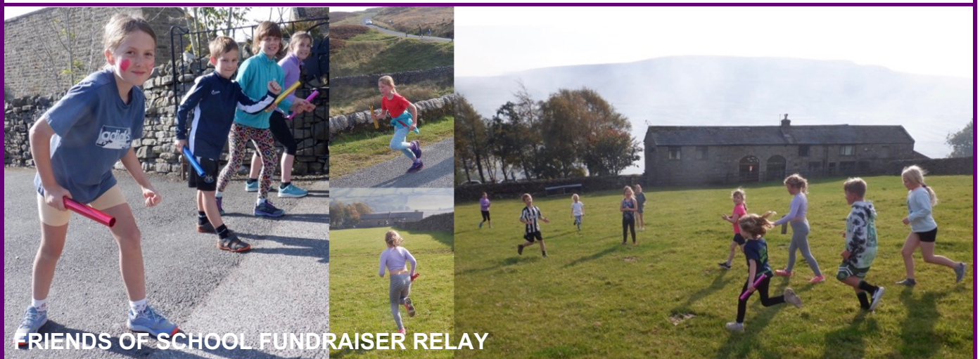
FRIENDS OF SCHOOL FUNDRAISER RELAY